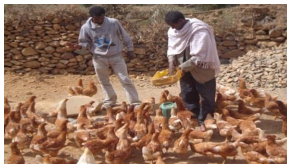
Photo 1 – On-farm activities to generate income

IFPRI has supported the MoA and FCA through: i) Knowledge and expertise in the recruitment of technical experts ii) Assisting delivery of training, technical back-stopping iii) Designing a monitoring and evaluation system for HABP and implementing project components such as Micro-Insurance iv) Increasing the capacity to perform technical analyses v) Contributing to sustainable systems for long term development